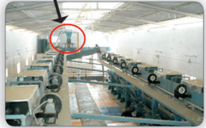
At Site Installed Air Separator

USERS FRIENDLY DESIGNS; OVER 7 YEARS EXPERIENCE!