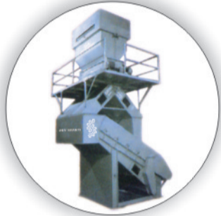
With Air Separator & Bypass