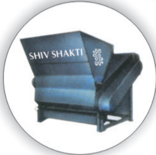
For Manual Feeding