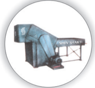
With feeding Belt

USERS FRIENDLY DESIGNS; OVER 7 YEARS EXPERIENCE!