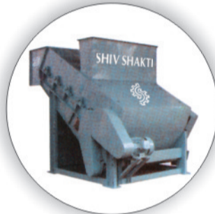
5 Cylinder Pre-Cleaner